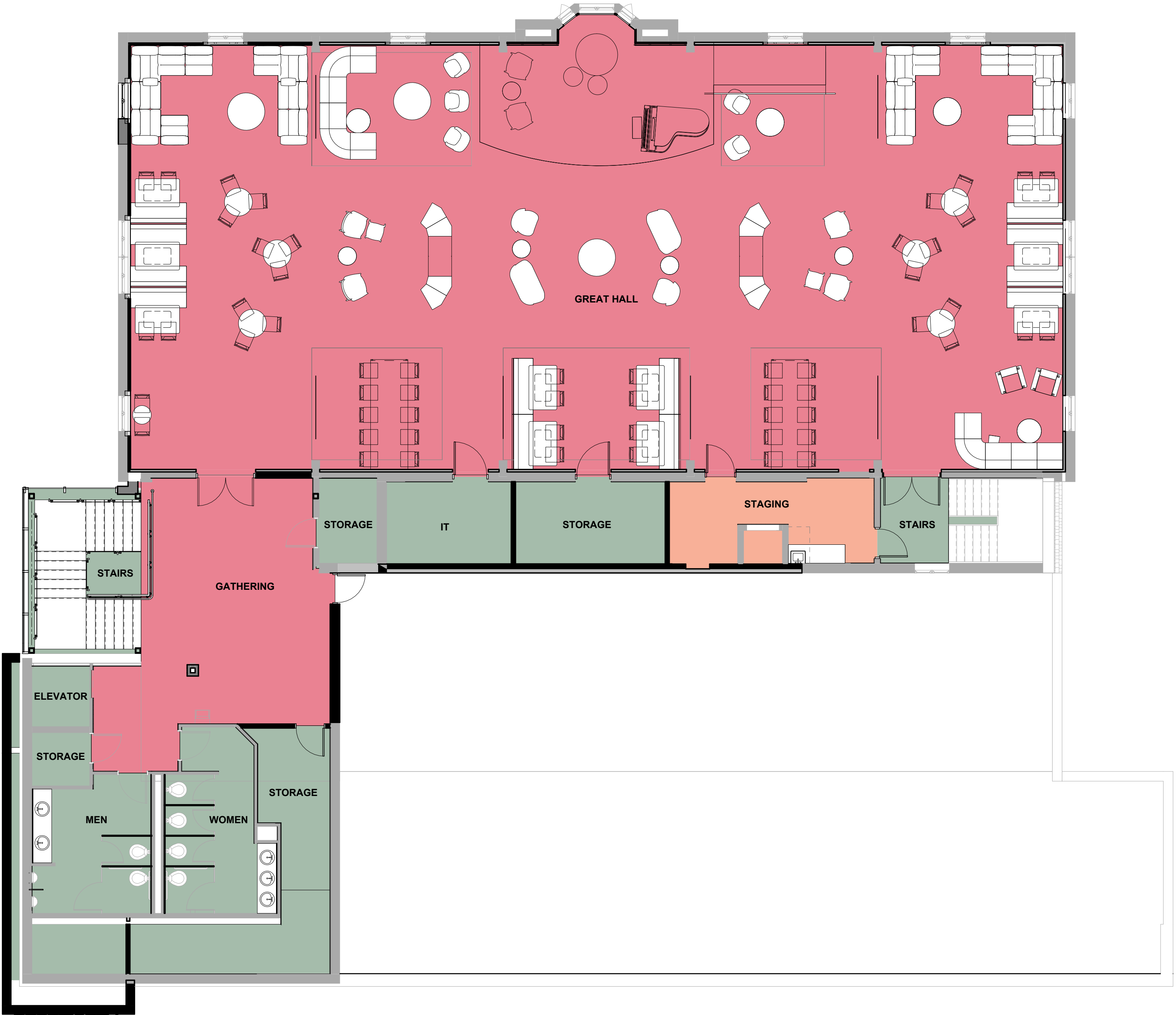
1 SECOND FLOOR SCALE: 1/8" = 1'-0"