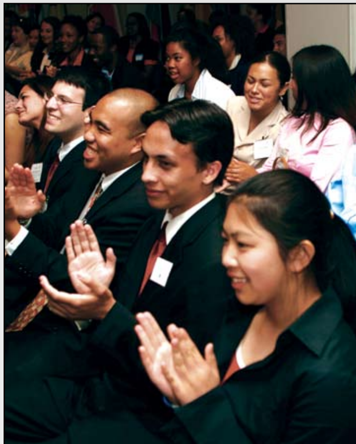
IIPP STUDY MISSION RECEPTION AT THE PEACE CORPS

Beyond its investments in human capital, the Institute has brokered or awarded millions of dollars in institutional assistance. IIPP routinely incubates new programs with strategically selected partner organizations. In addition, IIPP strengthens the capacity of minority institutions to create and maintain more internationally aware campuses and prepare students for international careers. Globalizing Business Schools (GBS), a program funded by IIPP, promotes the internationalization of business education on the campuses of Historically Black Colleges and Universities (HBCUs). The program is designed to raise awareness of the importance of international and interdisciplinary business education.