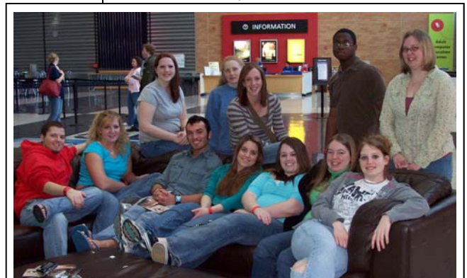
Students waiting to enter the IMAX at the St. Paul Science Center

the IMAX film "Hurricane on the Bayou" and then went on to spend a couple of hours in the exhibits. Our afternoon kicked off with a visit to the Weisman Art Museum, located on the University of Minnesota Campus. The main exhibit was an expansive Bob Dylan display. After leaving the museum, we returned to downtown Minneapolis where we spent the evening at Game Works. Level one of the building had a large arcade area with everything from Dance Dance Revolution to skee ball. We all had a fun time in the arcade, but quickly realized that we were hungry. We went upstairs to find a private room with a pizza buffet just for us.