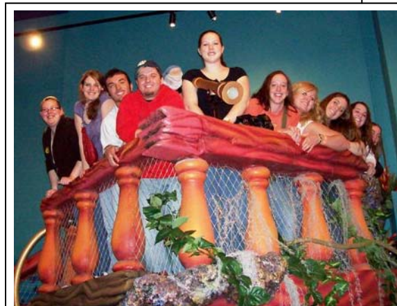
Group photo at the Underwater Aquarium