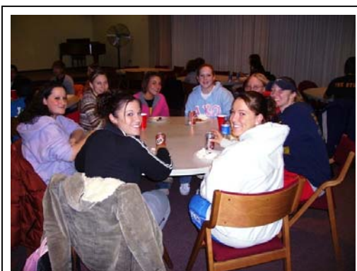
Students socializing while enjoying pizza