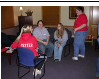
Students meet new friends and learn more about how Student Support Services can help them succeed at Simpson.