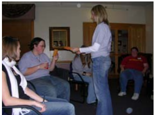
Sometimes the best way to support students is to provide them with food and fun. We had plenty of both at the SSS pizza party in December.