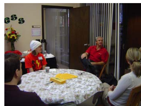
Few things say "welcome" like a pumpkin bar and a cup of hot chocolate, the featured fare at the SSS Open House in October.

We also love to share in the excitement of college life. If a student gets their first "A" on a paper, we want to be the first place they go to for a celebration. Overall, our main goal is to do all we can to ensure our students get their degree and have a fun time doing it!