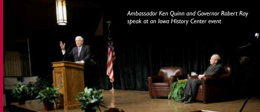
Ambassador Ken Quinn and Governor Robert Ray speak at an Iowa History Center event

The mission of the Iowa History Center is to advance the understanding and appreciation of Iowa history among our state's students, scholars and the general public.